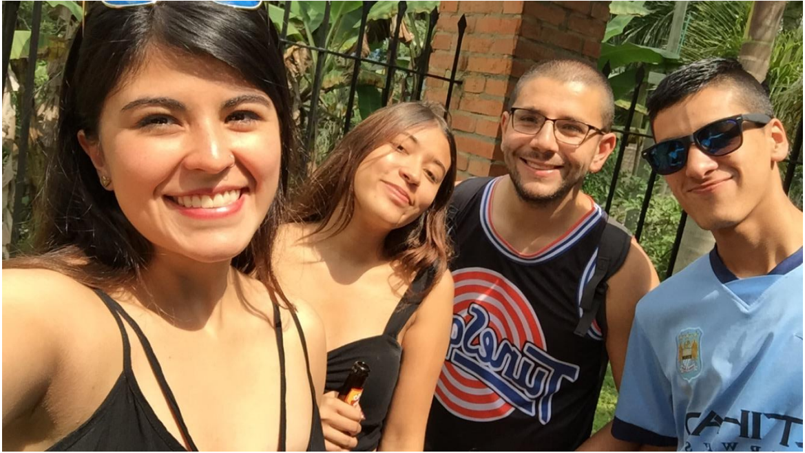
World Cup Russia 2018