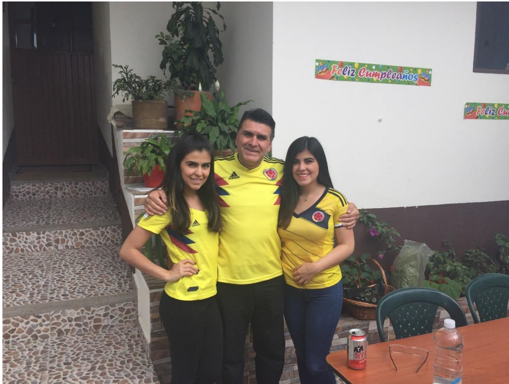
My 21st birthday